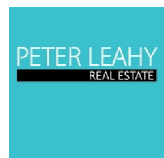
Rental Department 93505588