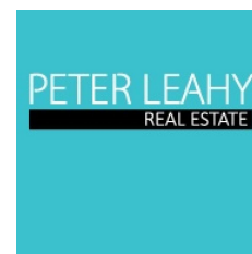
Rental Department 93505588