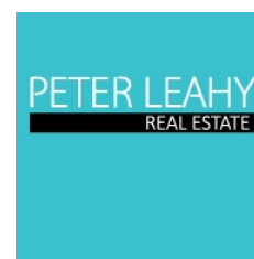
Rental Department 03 9350 5588