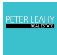
Rental Department 03 9350 5588