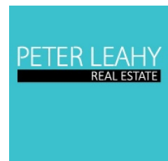
Rental Department 03 9350 5588