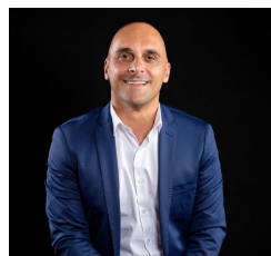
Marco Rabar 93505588

Price : Contact Agent Land Size : 850 sqm View : https://www.peterleahy.com.au/sale/vic/north/coburg-north/residential/house/7979682