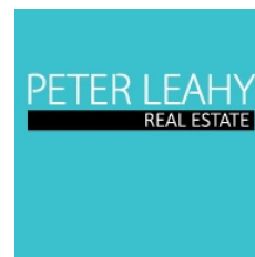
Rental Department 03 9350 5588