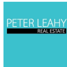
Rental Department 03 9350 5588